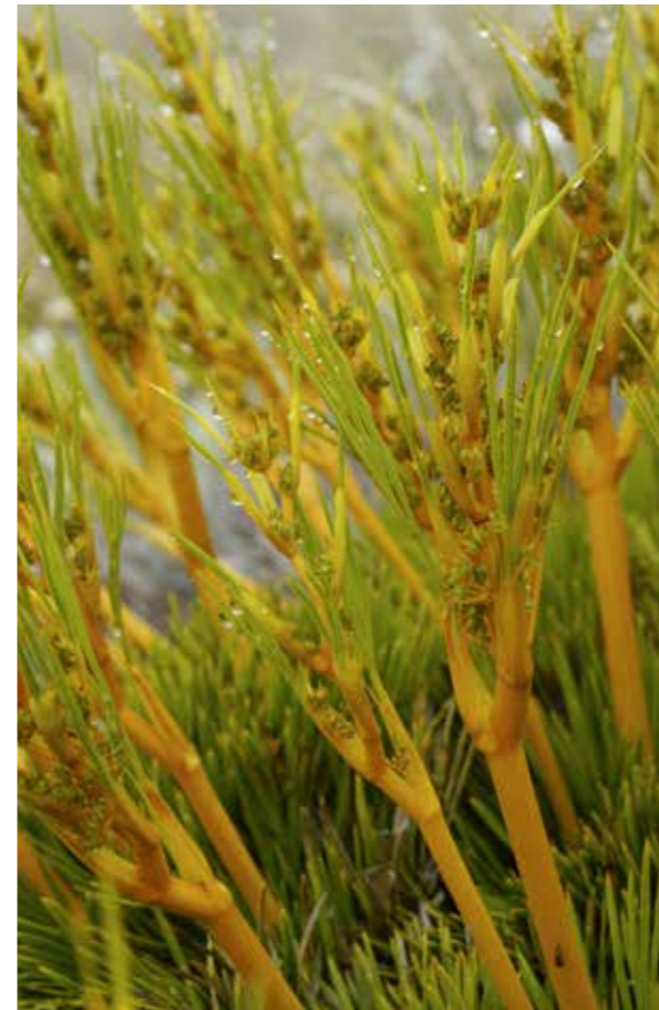
Aciphylla montana (female)