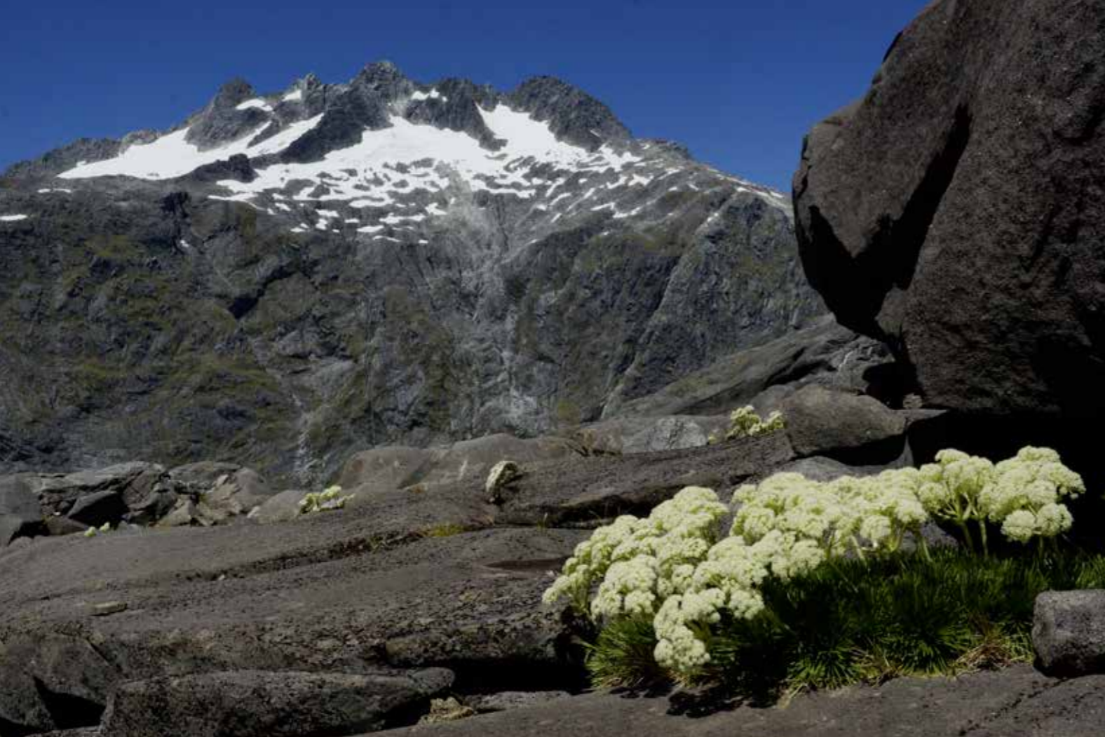
Aciphylla congesta at Gertrude Saddle.