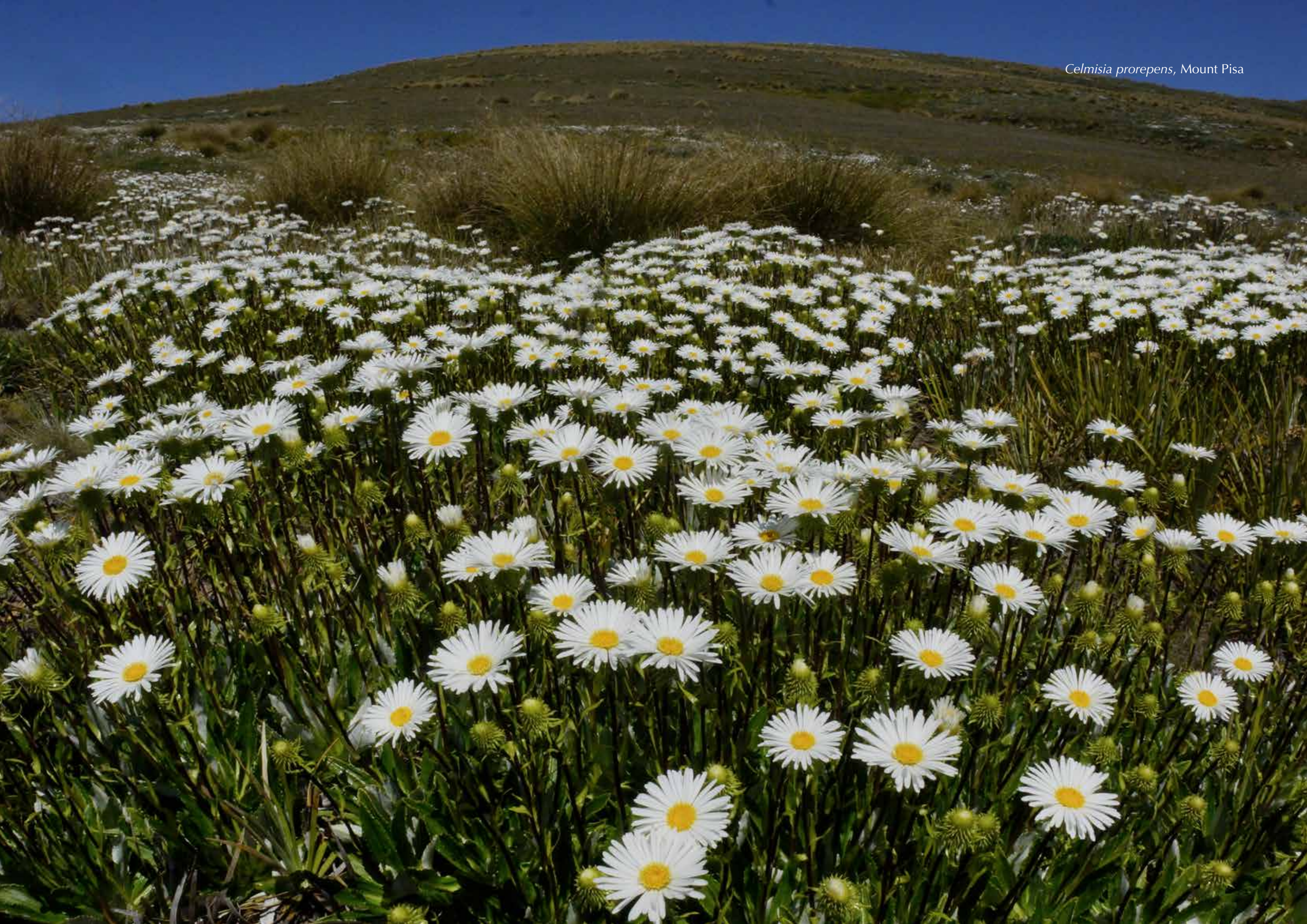
Celmisia prorepens , Mount Pisa