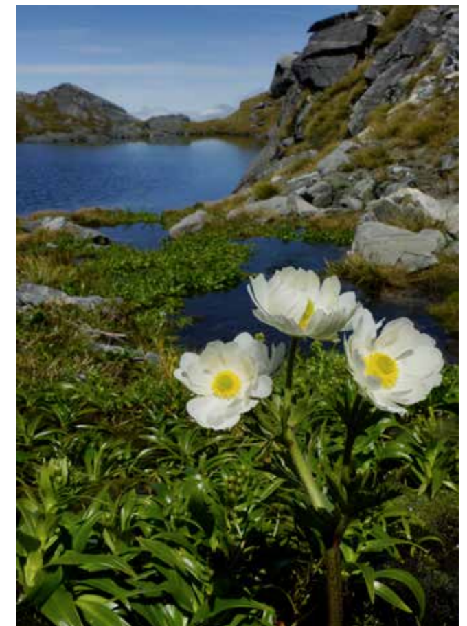
Ranunculus buchanani x lyallii