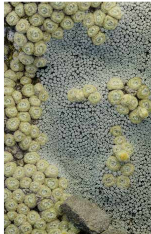
Haastia pulvinaris & Raoulia bryoides